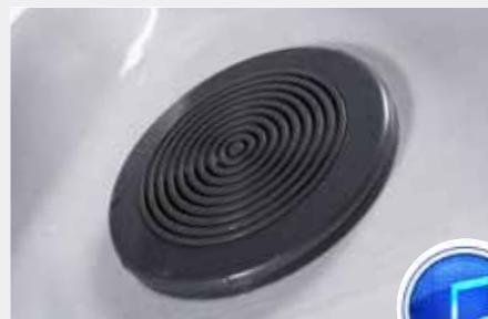
BLUETOOTH SOUND SYSTEM