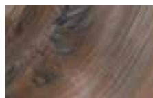
TUSCAN SUN UPGRADE