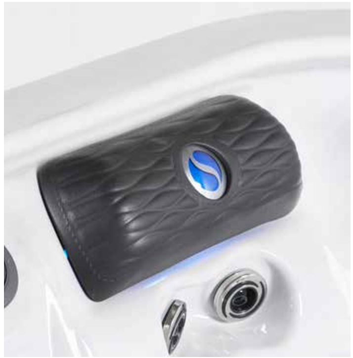
LED INSIGNIA HEADRESTS