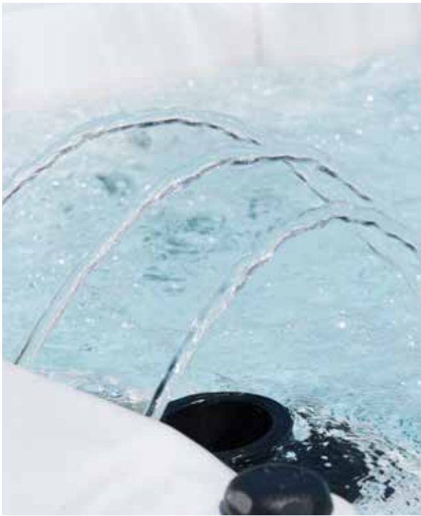
LED WATER COLUMNS