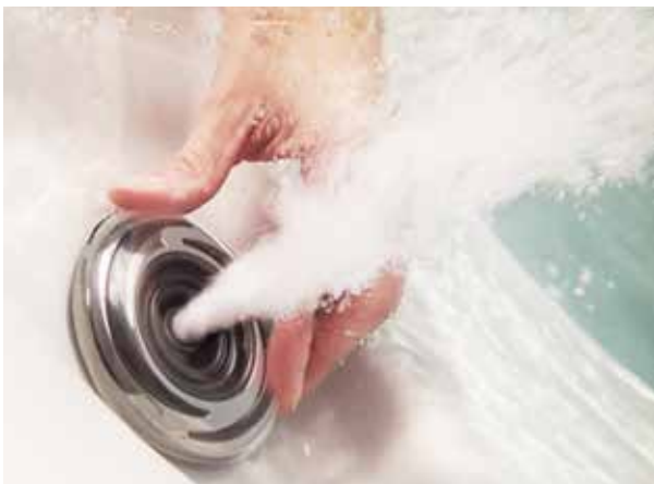
TWO-TONE STAINLESS STEEL ADJUSTABLE JETS