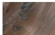
TUSCAN SUN UPGRADE